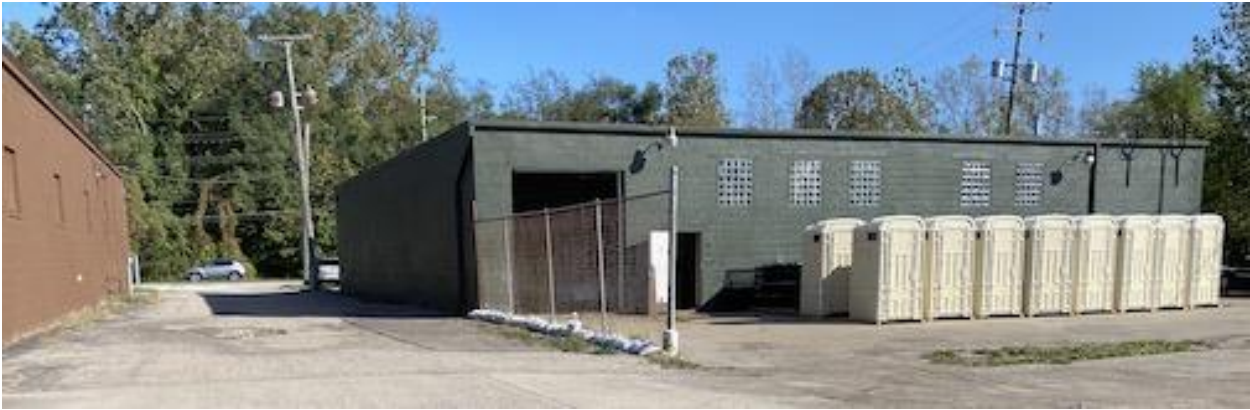
Building Four and Five