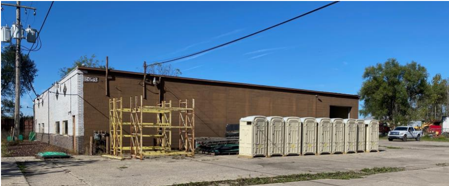
Lot 6 2 Acres Asphalt