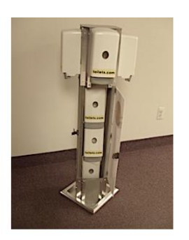
Folding Hand Sanitizer Station