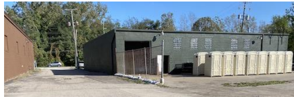
Buildings Four and Five