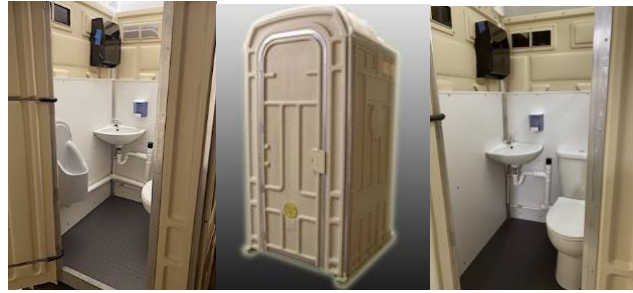
No Flush Urinal SJSDCS 520 Comfort Station Inside View

NO WASTE STORED IN THE LAVATORY STALLS – NO STEPS – NO CHEMICALS