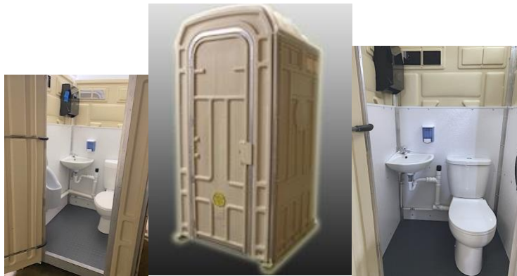
No Flush Urinal Men's Lavatory