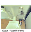
Water Pressure Pump