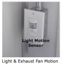
Light Motion Sensor