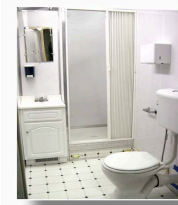
ADA Compliant Ground Level Lavatory Buildings Exterior Plumbing Upgrade Not Shown