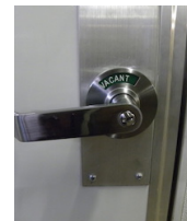
Usage Indicator Door Handle